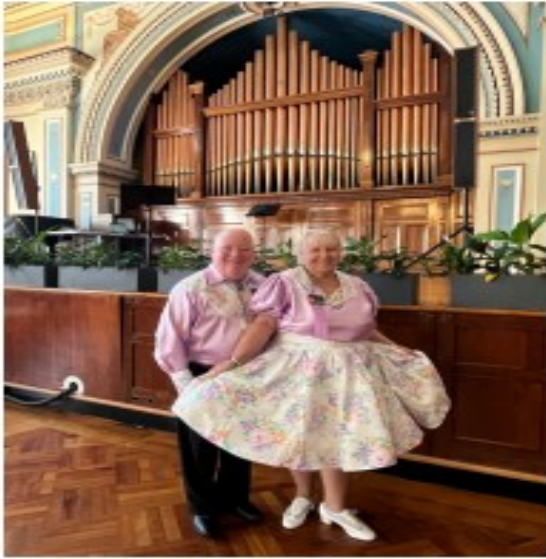
Hobart Town Hall