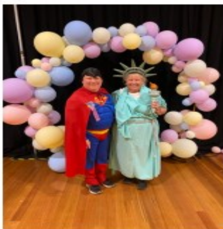
“S” Night 66th ANSDC