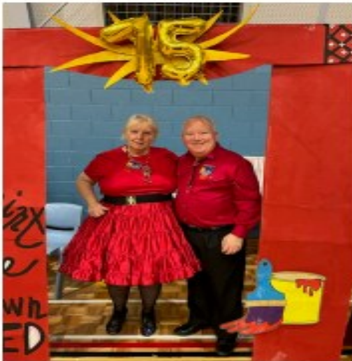
Launceston SDC 75th Birthday