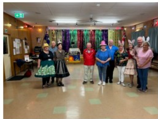
Sunset Twirlers Easter Dance 7 April 2026