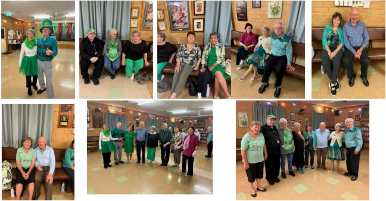
Sunset Twirlers St Patrick's Dance 17 March 2026