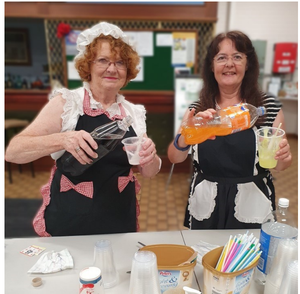
COOL SPIDERS ON A HOT NIGHT