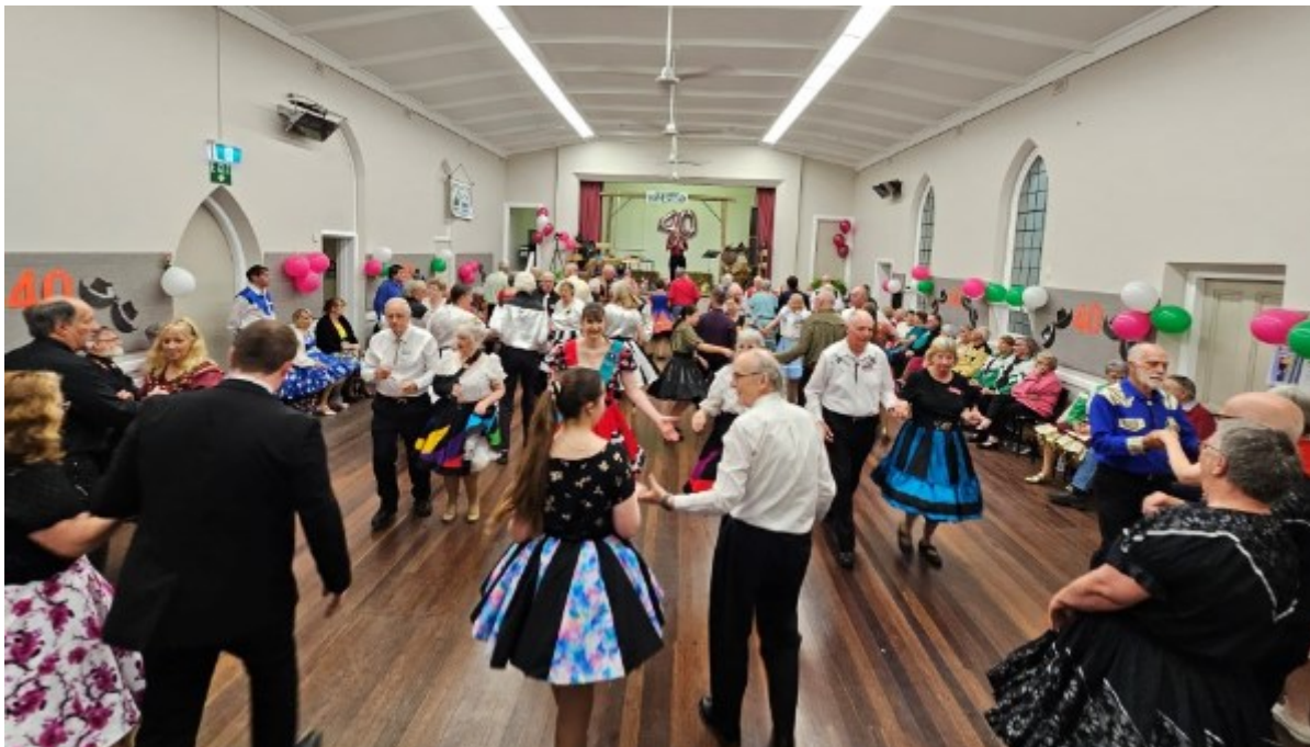
A Photo of the Dance Floor at Pine City Twirlers Birthday recently.