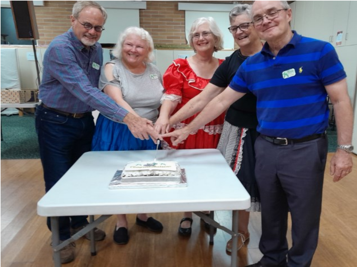
New Graduates at Wild Frontier March 2023