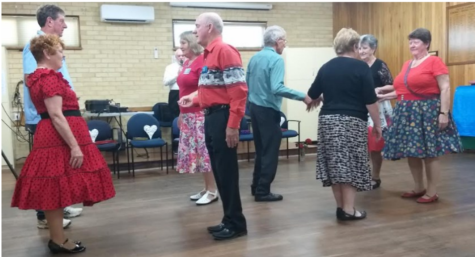
Paddlesteamers Valentines Dance 2023