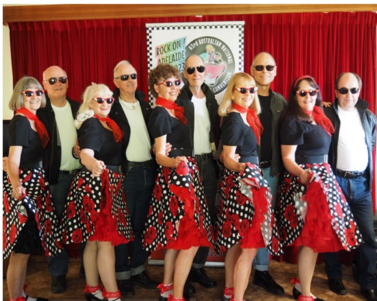
The Committee Dressed Set