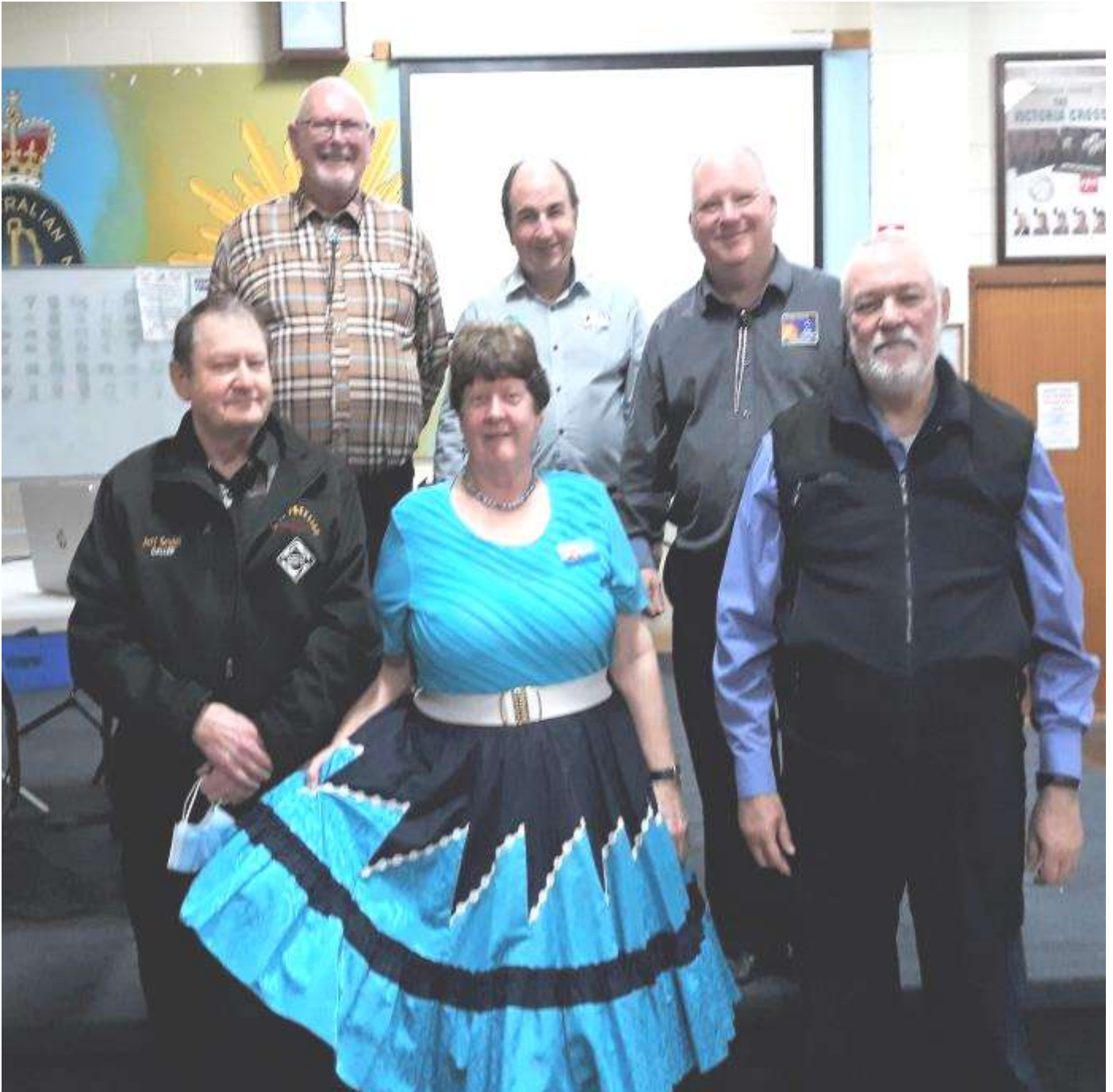
Callers at our July SASDS/SACA Dance