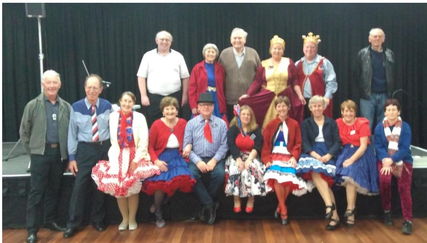
Sunset Twirlers British Night