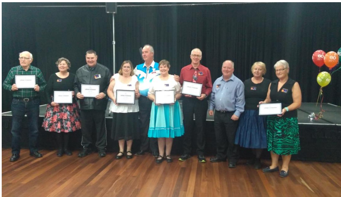
Sunset Twirlers Graduation 4 May 2021