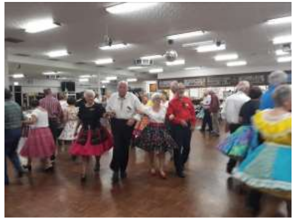
ADELAIDE OUTLAWS Easter Dance April 2021