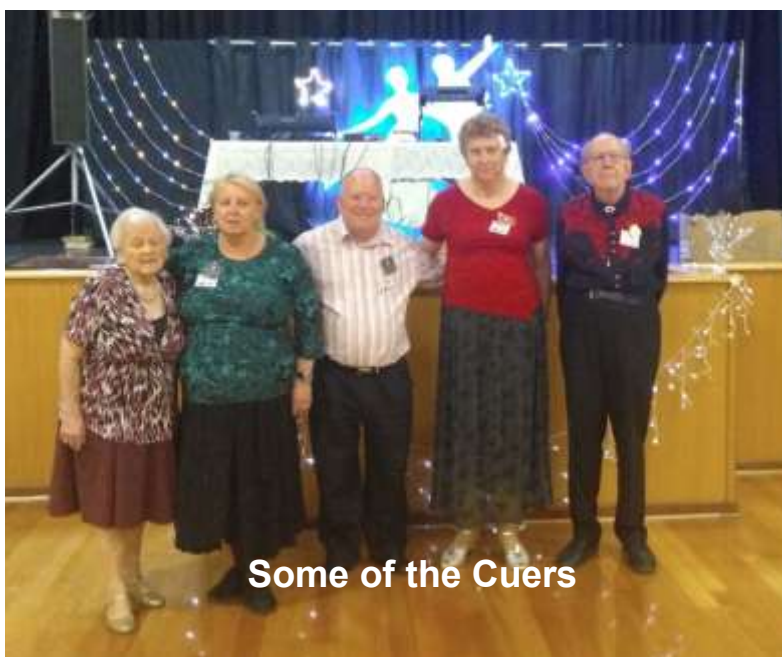
Some of the Cuers