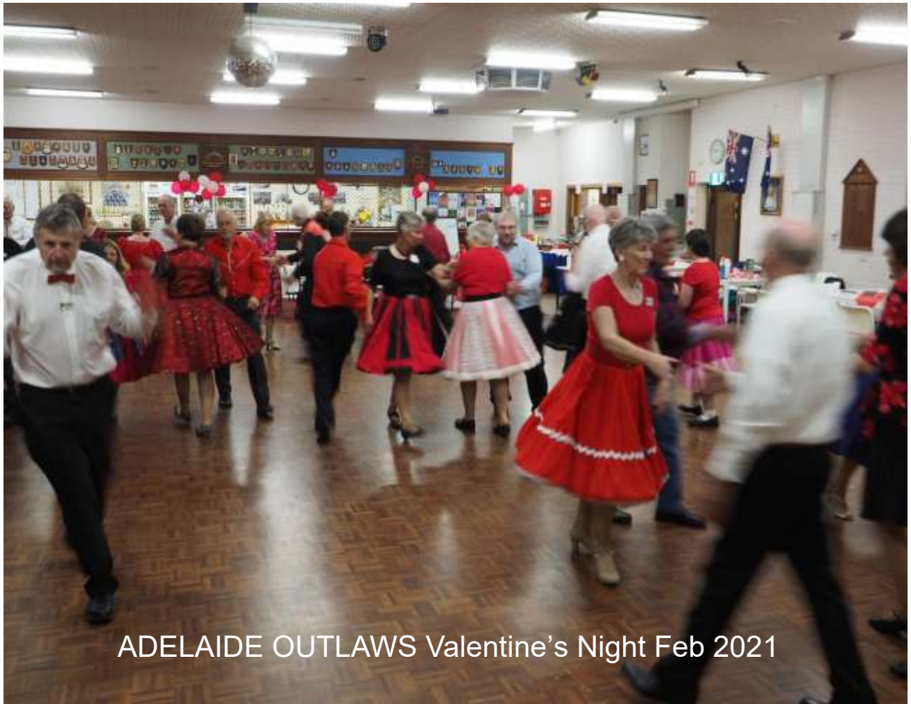
ADELAIDE OUTLAWS Valentine's Night Feb 2021