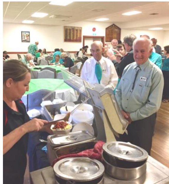
ADELAIDE OUTLAWS SPUD NIGHT MARCH 2020