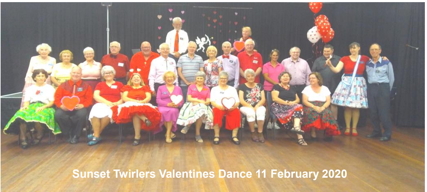
Sunset Twirlers Valentines Dance 11 February 2020