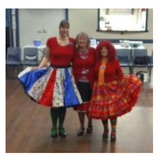
Team Tulloch at it again