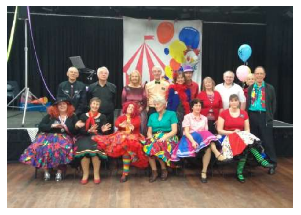
This picture was taken at the end of the night and we were playing "The Carnival is Over" hence the hand swaying (by some)