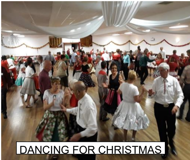
DANCING FOR CHRISTMAS