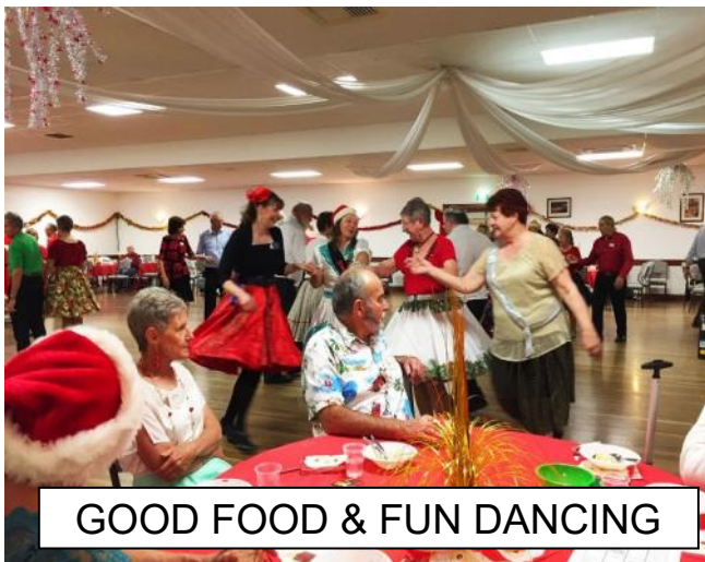
GOOD FOOD & FUN DANCING