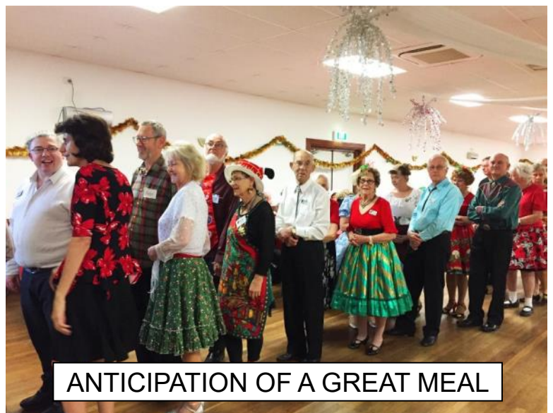
ANTICIPATION OF A GREAT MEAL