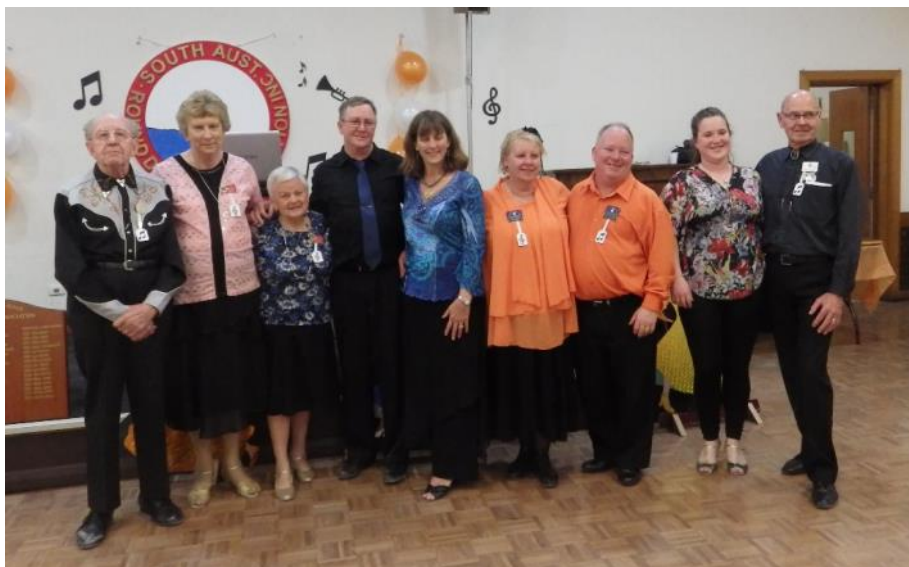
Showcase Choreographers 16th SA Round Dance Festival