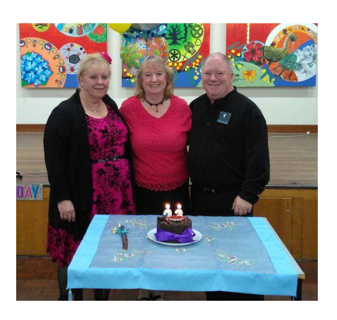
Sunset Twirlers Rounds