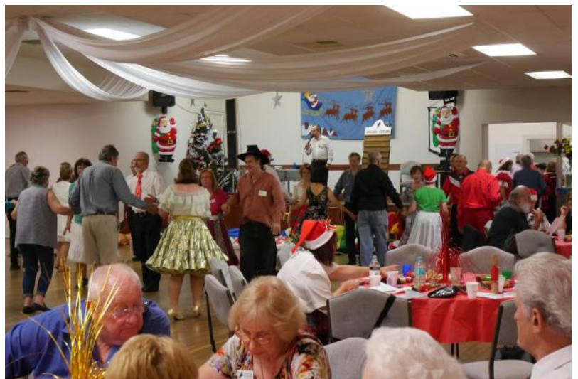
Adelaide Outlaws Christmas dinner/ dance