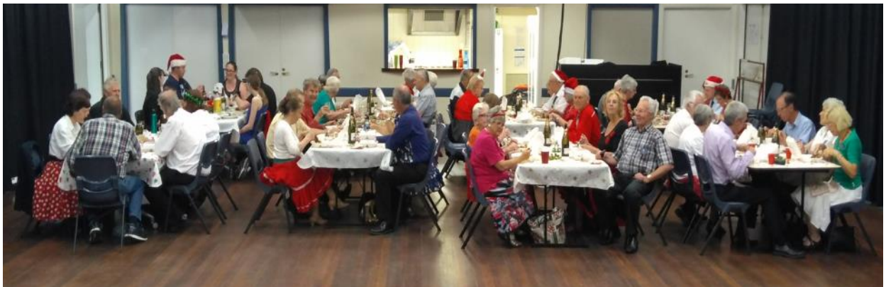
Sunset Twirlers Christmas dinner