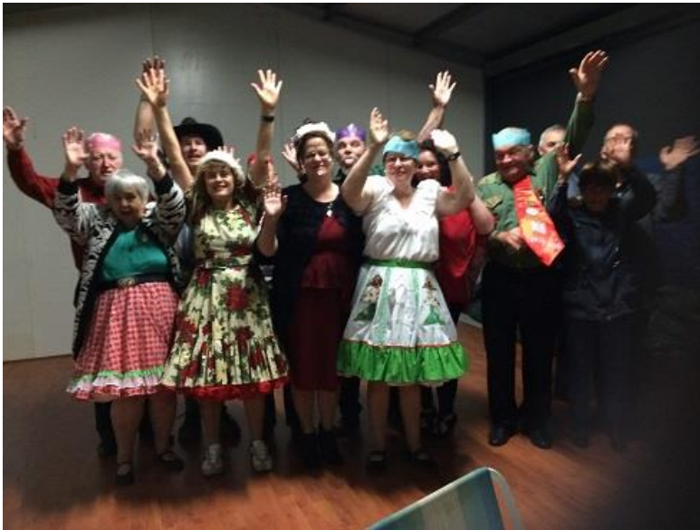
Allabout Squares Christmas party