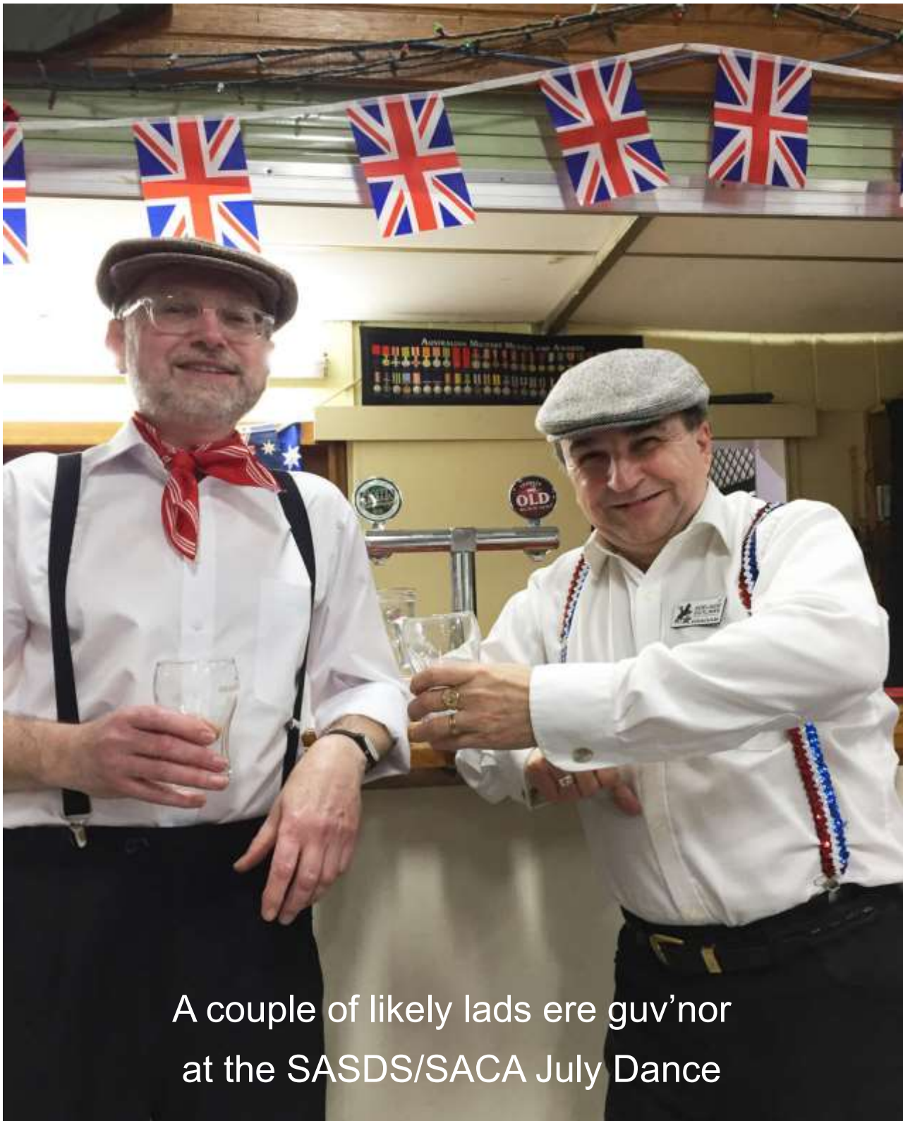
A couple of likely lads ere guv'nor at the SASDS/SACA July Dance