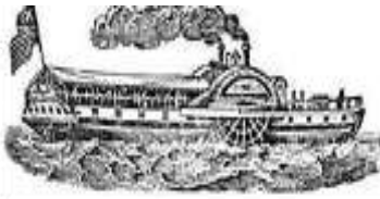
THE PADDLE STEAMER SQUARES DANCE CLUB INC

We've managed two Theme Nights recently with the first being 'Down Memory Lane' & the second was a 'Soup Night'.