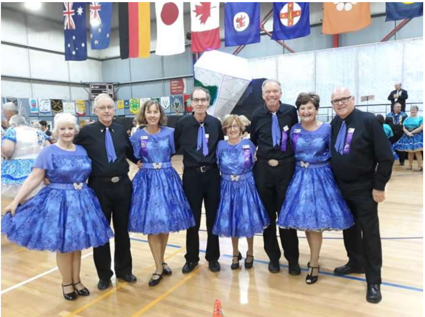
Dancers representing South Australia at the Tasmanian National Square Dance Convention