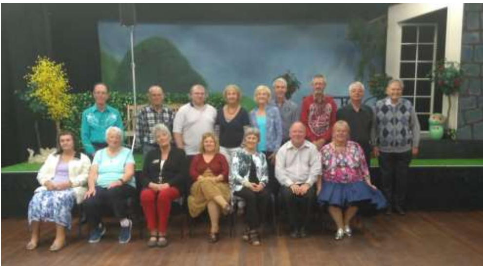
Noarlunga Theatre Co. Backdrop